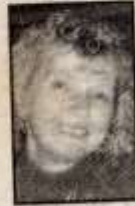
Floral City Garden Club Bassett

November's program was very informative about Haze Gardens and hydroponic gardening thanks to Crystal Raulerson. The hostesses had a light luncheon with Veteran's Day decorations in