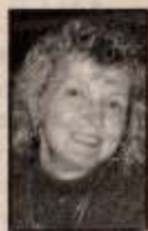
Floral City Garden Club

Our participation in the Bikes 'n' BBQ to raise money to support the "Santa's Workshop" at Camp E-Nini Hassee was a success, with just under $200 raised. This is a project the Floral City Garden Club has sup-