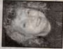
Floral City Garden Club