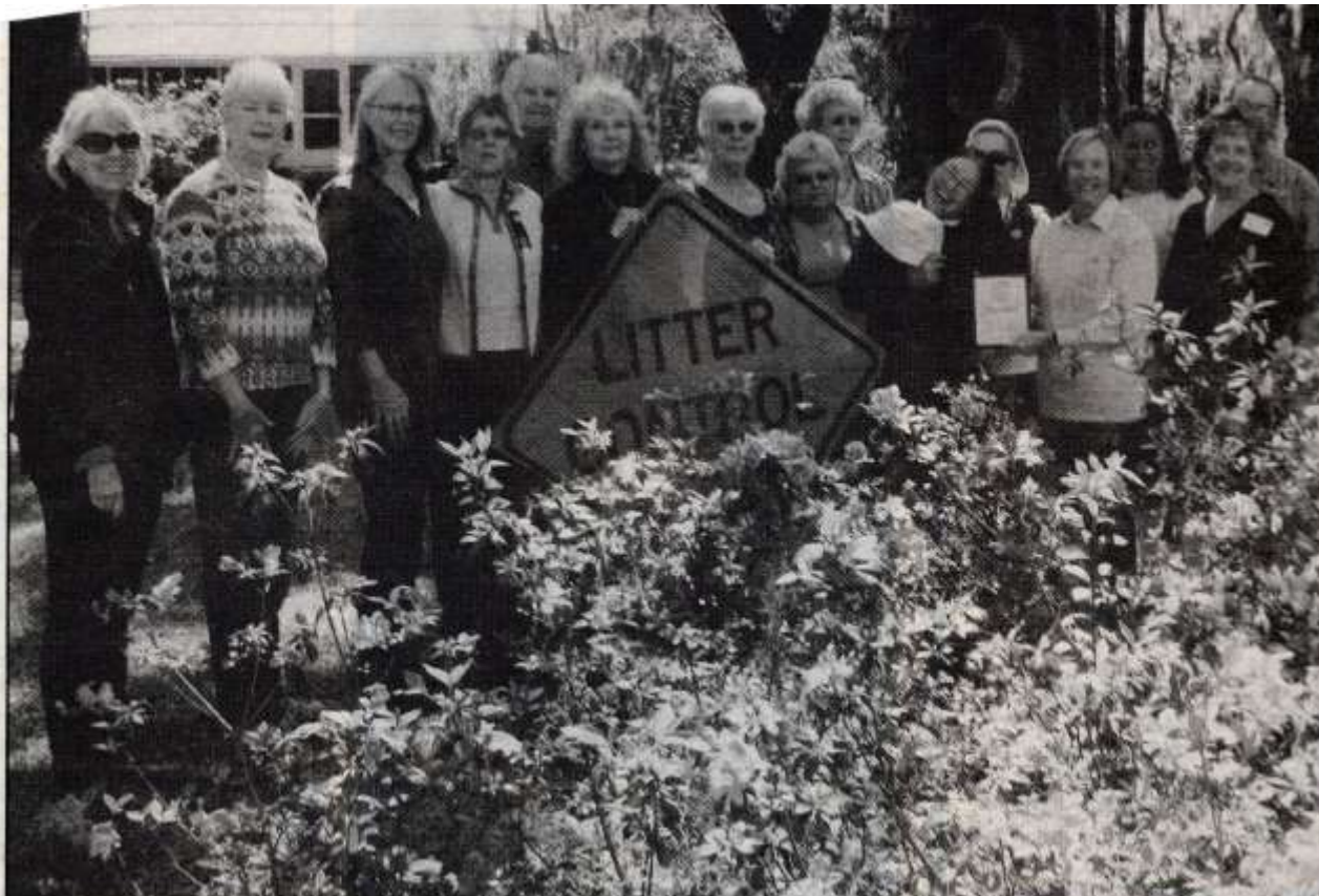
Special to the Pioneer