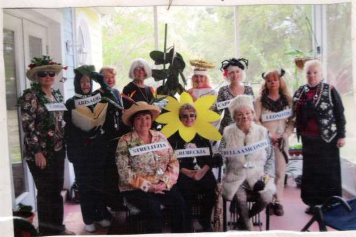
FCGC Christmas Party Luncheon