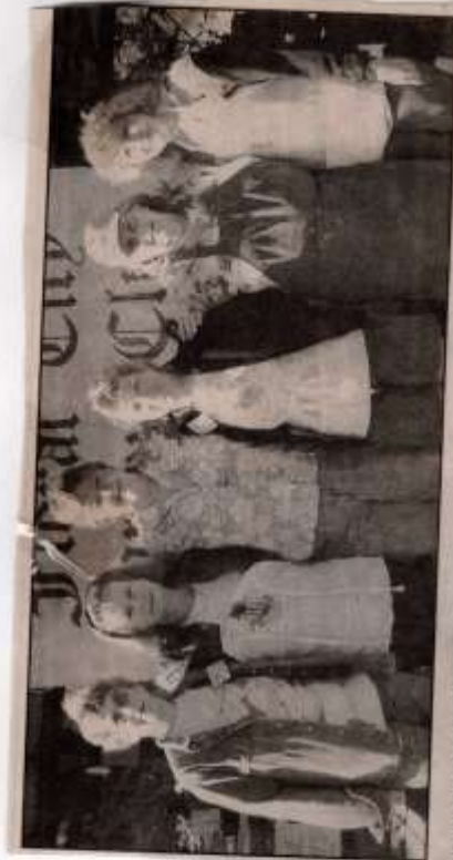
Florist City Garden Club members prepare for their 2010 annual plant sale at the pavilion located at 4599 E. Marvin St. in Florist City. This year's sale will take place on Saturday, March 27, at 9 a.m. at the same venue. Garden club members are pictured here.