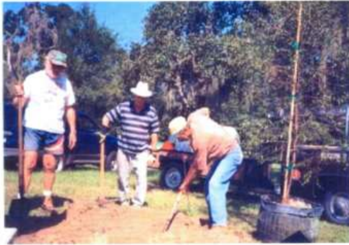
Prunus Umbellata (Flatwoods Plum Trees) purchased & donated by FC Heritage Council planted by members of Floral City Garden Club