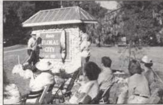
Residents, volunteers and county officials were on hand Oct. 18 to dedicate Floral City's new welcome sign.