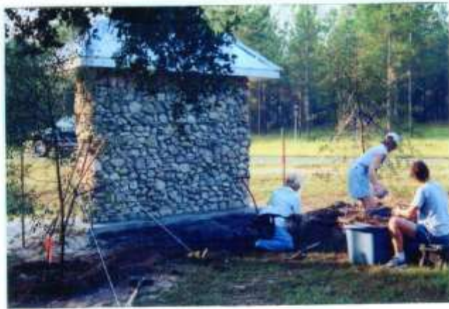
Myrcianthes Fragrans (Simpson's Stoppers) & Viburnum Obovatum (Walter's Viburnum) compact forms purchased from CFNF All Native Nursery donated and planted by FCGC members