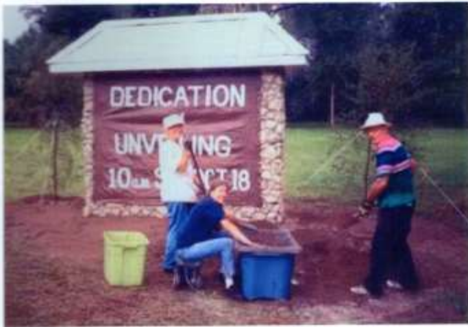
Soil preparation by members of Floral City Garden Club